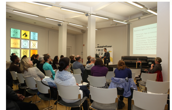
Reviewing Conference of the Bayreuth Academy, June 2016

Research on this topic follows two lines of activity. Firstly, a total of five sub-projects pursue research on specific aspects of the general theme from different disciplinary perspectives. They run for the entire project period with a focus on different parts of Africa and African Diasporas. A historiographical sub-project studies the transformation of narratives of ‘Future’ in the 19th and 20th centuries. Models of time and future in nature are examined as informing conservation strategies or coping with climate change.