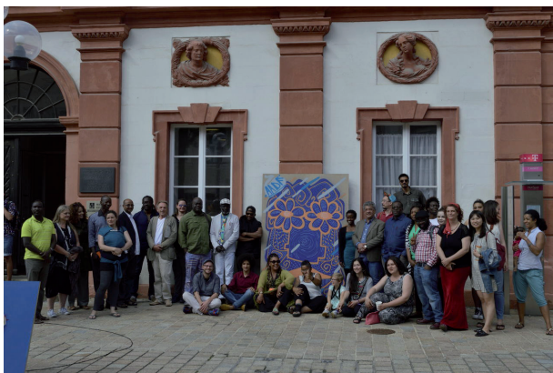
Your Team of the BIGSAS-Festival and African-diasporic literatures

art as a form of resistance against different dominant discourses in African nations and their diasporas? And how does street art in Africa and its diasporas resist the appropriation of space and subvert its homogenic imperatives? How can street art contribute to the project of decolonizing Europe? And in what sense is decolonization a mode of resistance? Whose hopes are involved? And which challenges are to be faced? Let us talk about the ways in which feminist, anti-racist, decolonizing and abrogating ideas and strategies resist the legacy of the past, while heading into revolutionized spaces and times and insisting on the multiplicity and relationality of spaces and their (fictional) stories. Let us move and muse through the new futures that we will owe to different forms of resistance. #Let's hope, let's dream, let's resist until freedom, equality and justice are achieved for all in a better world.